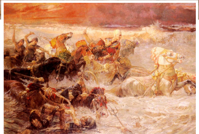
Painting by Bridgman © 1900 Public Domain

My brothers, it appears that here in the Middle East the rules are different than in the rest of the world. Peace can only be achieved after you have been victorious over your enemy. Moreover, I believe that any peace which comes after this war is still only temporary.