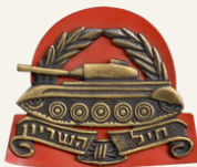
Modern war chariot - Wikipedia RonB CC

In biblical times, a sense of security was dependent upon the might of a country's leaders and how they provided for those under their rule. For instance how many battle chariots were in the king's army? (Chariots were like powerful armored tanks in ancient warfare.) Another illustration of the importance of resources can be seen in the migrations of people to Egypt, at that time a center of great physical and spiritual wealth. The account of Joseph and Egypt's storehouse of wheat is only one example of the vast wealth of the area along the Nile River and the exports of Egyptian wheat. Gold, copper, livestock and agriculture were part of the strength of Egypt that caused others to put their trust in her. When the Israelites were in the desert, they longed for the foods of Egypt, conveniently forgetting that they had lived there as slaves (Numbers 11:4-6).