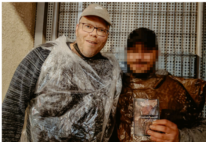
An Arab man gets a copy of "Run Baby Run" from a volunteer at our outreach